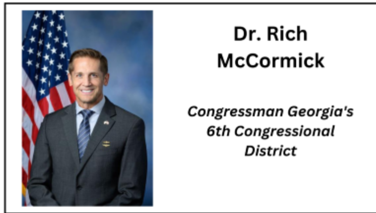
Dr. Rich McCormick

Congressman Georgia's 6th Congressional District