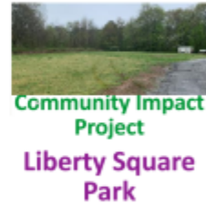
Community Impact Project Liberty Square Park