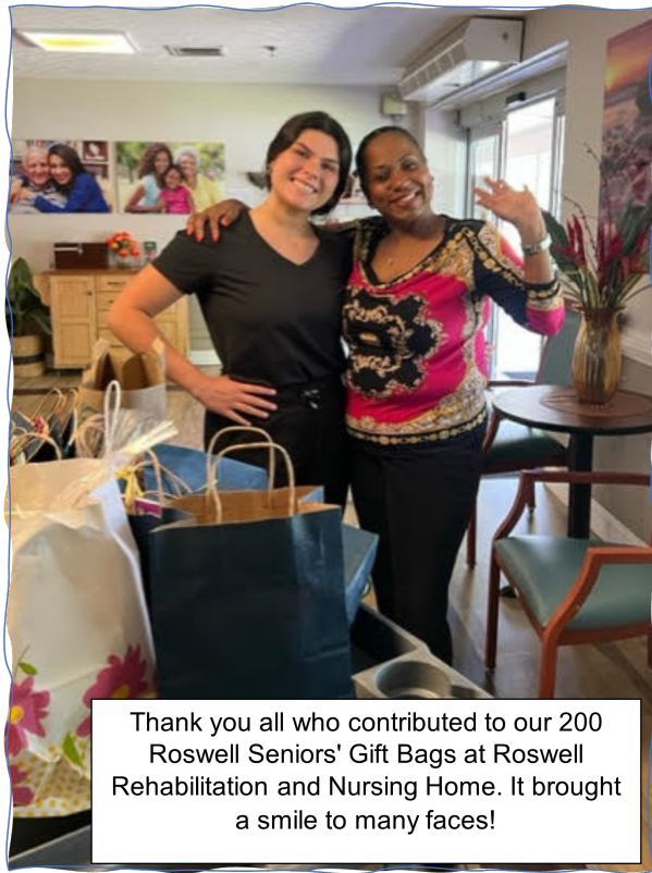
Thank you all who contributed to our 200 Roswell Seniors' Gift Bags at Roswell Rehabilitation and Nursing Home. It brought a smile to many faces!