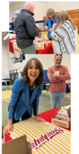
Stuckey's Branding Rocks!!