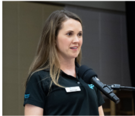
Great presentation on Parkinson's